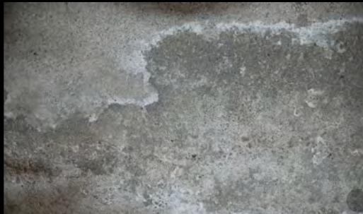
STOPS MOLD & MILDEW