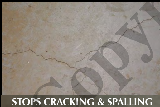
STOPS CRACKING & SPALLING